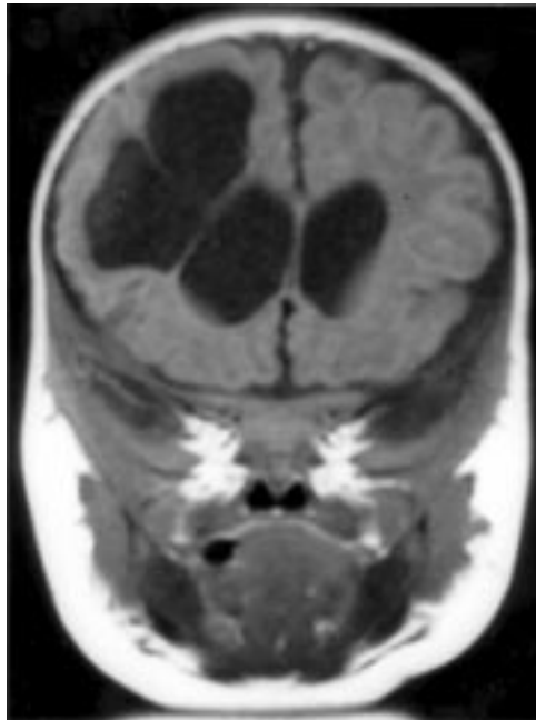
Figure 2 Magnetic resonance imaging in a boy with heterozygous factor V Leiden mutation showing porencephalic cyst in the right temporal area.

bradyarrhythmia—were documented in nine of the 24 mothers investigated.