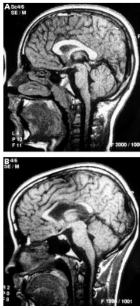
Figure 1 Sagittal T1 weighted spin echo MR images of the brain (TR = 387 ms, TE = 20 ms): (A) normal corpus callosum; (B) noticeable thinning of corpus callosum, particularly in middle section.

Measurements were made of the overall length of the corpus callosum, the cross sectional areas of the sagittal, left and right transverse and coronal sections of the brain, the cross sectional area of the corpus callosum (entire and as anterior, middle, and posterior parts), and the transverse and coronal mid cross sectional areas of the right and left caudate nuclei. The cross sectional area of the corpus callosum as a percentage of the sagittal sectional area of the brain, and the transverse