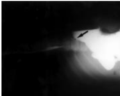
Figure 2 Antero-posterior radiograph of a barium swallow in a mature infant lying in the right lateral position. Even though the stomach is not full, the gastro-oesophageal junction (arrowed) is submerged beneath the air-fluid level in the gastric fundus.

oesophagus and poor clearance of refluxed material, respectively. The former is more likely to occur if the stomach contents about the LOS: the LOS is posteriorly positioned relative to the rest of the stomach so this is more likely to occur with the infant supine. In the prone position the gastric contents are likely to settle in the body and antrum of the stomach away from the LOS. In the lateral positions the gastric contents will settle either in the antrum and lesser curvature of the stomach (right lateral) (fig 2) or the body and greater curvature (left lateral) (fig 3). The body of the stomach may offer a greater reservoir volume which keeps the level of gastric contents away from the LOS. The pressure from the gastric contents on the gastro-oesophageal angle when in the left lateral position may also improve LOS pressure, thus reducing the tendency of the sphincter to relax.