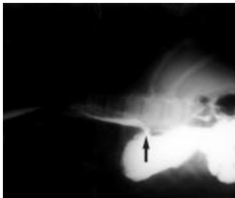
Figure 3 Postero-anterior radiograph of a barium swallow in a mature infant lying in the left lateral position. The reservoir function of the body of the stomach, keeping the gastric contents below the level of the gastro-oesophageal junction (arrowed), is shown. NB: barium is present in the oesophagus in both films. The infants swallowed barium to delineate the oesophagus; these images do not represent reflux episodes.

The effect of body position on gastric emptying in preterm infants is uncertain. Yu indicated that gastric emptying may be delayed in the left lateral and supine positions, 25 although a different group found no difference between position and gastric emptying. 26 However, previous studies in preterm infants have