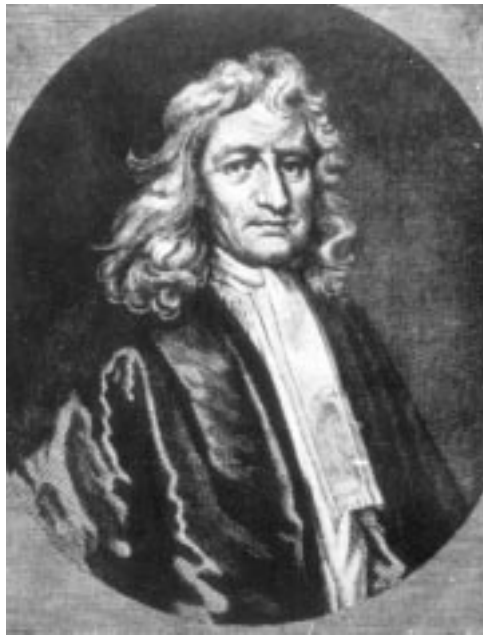
Figure 2 Dr Peter Chamberlen (1601–83).

heard peculiar noises, ringing bells, and other sinister sounds as the “secret” went to work.