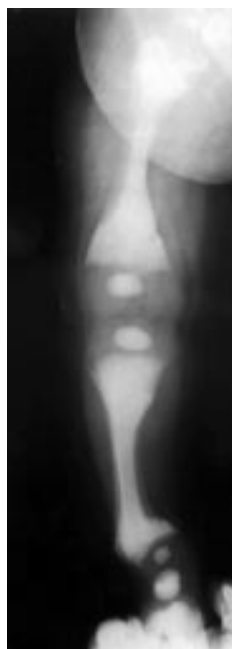
Figure 2 Plain radiograph of right lower limb showing generalised osteosclerosis and a "bone within a bone" appearance. The metaphyses are irregular and there is varus deformity of the distal tibia and proximal femur. These are characteristic appearances of osteopetrosis and secondary rickets.

gen mismatched sibling. Only two survive: one who received a matched sibling transplant at 6 months of age and the other a T cell depleted matched unrelated donor transplant at 6 weeks. Both patients have normal bone density, visual acuity and fields, and are free of all symptoms of disease three and five years after the transplantation. The second of these patients has a strabismus, thought to be familial in origin and improving with age.