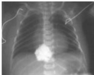
Figure 2 Radiograph showing spillage of dye in the extraperitoneal space.

In each of these case reports, femoral catheter tip migration was detected after extravascular extravasation of blood or parenteral nutrition fluid. Haemoperitoneum has been reported in the past as a complication