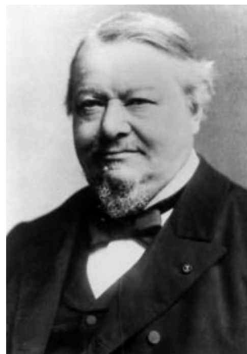
Figure 1 Stéphane Tarnier (1828–1897).

Tarnier's observations on the management of the umbilical cord and on birth asphyxia are also of great interest. 6