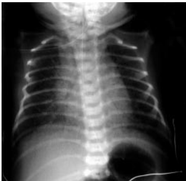
Figure 1 Radiograph taken several hours after birth suggesting respiratory distress syndrome I–II. No other abnormalities can be seen.

The patient developed signs of respiratory distress several hours after birth consisting of nasal flaring, grunting, intercostal and subcostal retractions, and tachypnoeic respiration with increased oxygen requirement until 60%. Breath sounds were normal. A chest radiograph suggested respiratory distress syndrome I–II (fig 1). Differential diagnosis included group B streptococcal pneumonia or wet lung. The patient was treated with continuous positive airway pressure (CPAP) with extra