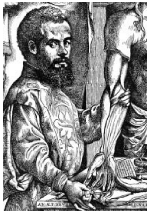
Figure 1 Andreas Vesalius, 1514–1564.