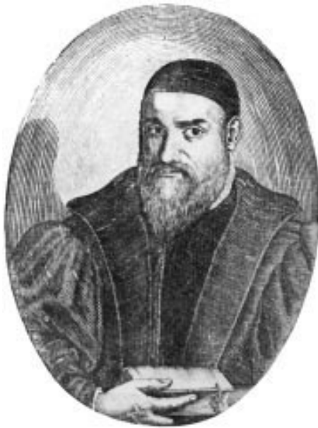
Figure 2 Gabriele Fallopius, 1523–1562.

with murder by the Inquisition, because, on undertaking a postmortem examination of a nobleman who had first died, the heart was found to be still beating feebly. Fortunately the King intervened and commuted the sentence to a pilgrimage to the Holy Land. While in Jerusalem, he heard of Fallopius' death together with an offer to accept again the professorship