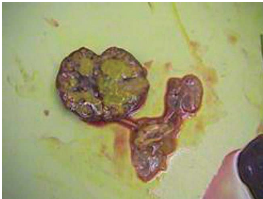
Figure 2 Gross pathology, showing multiple fungal abscesses.