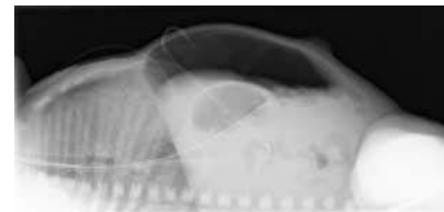
Figure 2 Abdominal radiograph confirming pneumoperitoneum.

disease. An umbilical arterial catheter was inserted but removed after a few hours due to duskeness of the toes. On day 2 she was extubated and nCPAP was tried. After a few hours, her condition deteriorated and she returned to conventional ventilation. On day 4, she was started on enteral feeding, using small volumes of breast milk, but had mild abdominal distension and some aspirates. Feeding was stopped. Her abdomen deteriorated and she had persistent metabolic acidosis. Transillumination of her abdomen was positive (fig 1) for pneumoperitoneum and was confirmed by abdominal x ray examination (fig 2). At laparotomy, two small gastric perforations were identified with local areas of infarction. These were oversewn, with excellent results.