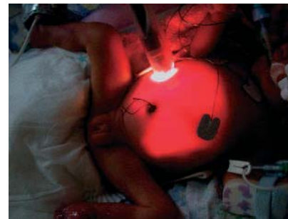
Figure 1 Transillumination of the abdomen showing pneumoperitoneum.

We highlight these two points relating to a recent case. A 29 week gestation baby girl was born by vaginal delivery. She initially required conventional ventilation for her lung