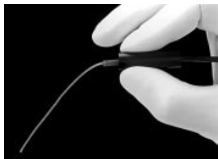
Figure 1 Probe microphone/tube used to measure noise intensity.

Although numerous studies have been performed to determine noise levels on neonatal units, they have been carried out using sound level meters 7,14–16 rather than probe microphones. Further, no study has measured noise levels in the post-nasal