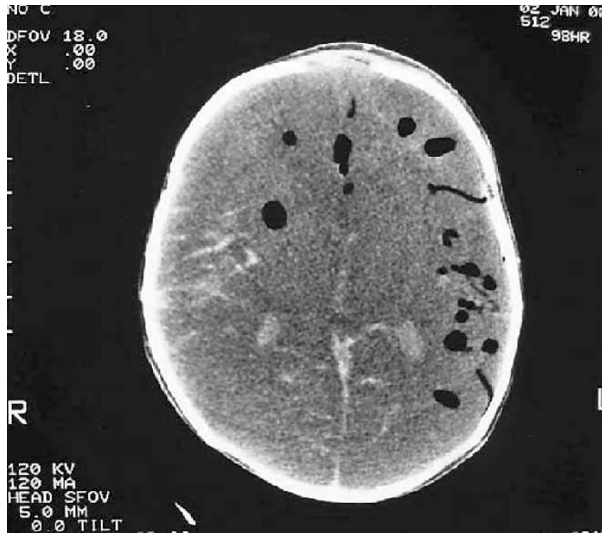
Figure 1 Computed tomography scan of the brain of a 10 day old male infant showing diffuse pneumocephalus.

M R Sedaghatian P Ramachandran N Rashid Mafraq Hospital, PB 2951, Abu Dhabi, United Arab Emirates; sreza@emirates.net.ae