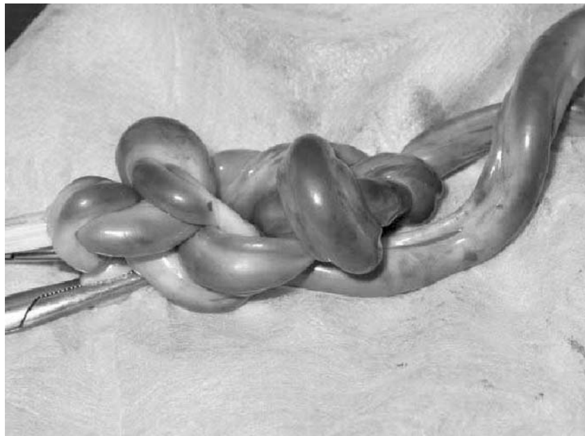
Figure 1 Complex umbilical knotting in a monochorionic monoamniotic twin pregnancy.

It is a major misconception that a knotted cord poses a major threat to the blood supply. Despite the compound appearance of the knots, both twins were born in good condition. Normal Apgar scores 2 and cord pH values 3 are the usual outcome as reported in our case.