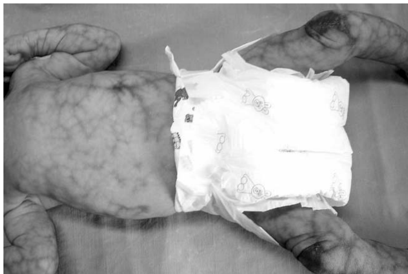
Figure 1 Photograph showing generalised cutis marmorata, dilated superficial veins, and telangiectasia involving the trunk and limbs. Consent for this figure was obtained from the patient's parents.

Cutis marmorata telangiectatica congenita 1 is a rare benign sporadic congenital vascular anomaly characterised by persistent cutis marmorata, telangiectasia, and phlebectasia and often associated with skin atrophy and ulceration. 2 The cutaneous lesions commonly occur on the legs, arms, and trunk and rarely involve the face and scalp. Associated abnormalities such as body asymmetry, vascular and neurological anomalies, glaucoma, macrocephaly, and psychomotor retardation occur in many patients. The diagnosis is mainly clinical, and prognosis is generally good, with cutaneous lesions improving during infancy. There is no specific treatment, and long term follow up is indicated with associated abnormalities.