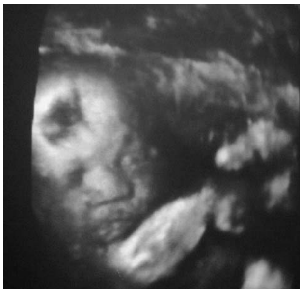
Figure 1 Skin tag-like lesions over left orbital region seen on three dimensional image at 28 weeks gestation.

Department of Pediatrics, Tri-Service General Hospital, Taipei, Taiwan, ROC