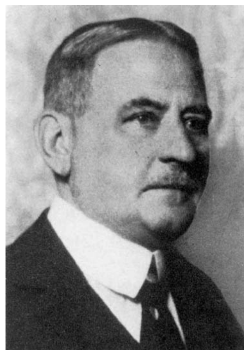
Figure 1 James Clifton Edgar (1859–1939).

“Alcoholism: It was not until 1900 that Nicloux was able to demonstrate that the drug in question enters the fetal circulation. He gave a woman milk-punches after she was well along toward delivery, and was able to distil some of the alcohol from the blood of the umbilical vein. In regard to the effects of alcoholism on pregnancy, as studied in a series of chronic drunkards, there is no evidence of any strong tendency to abortion. Still-birth is quite common, but the principal effect of alcohol upon the fetus is shown in the extraordinary tendency to