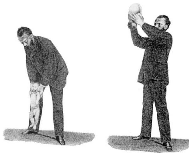
Figure 1 Illustration (reputedly of Dr Bernhard Schultze himself) demonstrating the Schultze method of neonatal resuscitation. From Schultze BS. Der Scheintod Neugeborener . Jenna: Mauke's Verlag, 1871.

newborns in 1952 and published it the following year. 22 Its purpose was “the re-establishment of simple, clear classification or ‘grading’ of newborn infants which can be used as a basis for discussion and comparison of the results of obstetric practices, types of maternal pain relief and the effects of resuscitation”. Her score prompted new focus on the newborn infant in the delivery room and is still assigned almost universally today. In 1963 Herbert Barrie again described equipment similar to that in use today and recommended guidelines for resuscitation. These included the oral administration of Vandid (vanillic acid N,N -diethylamide, a strychnine derivative) if apnoea persisted for more than three minutes.